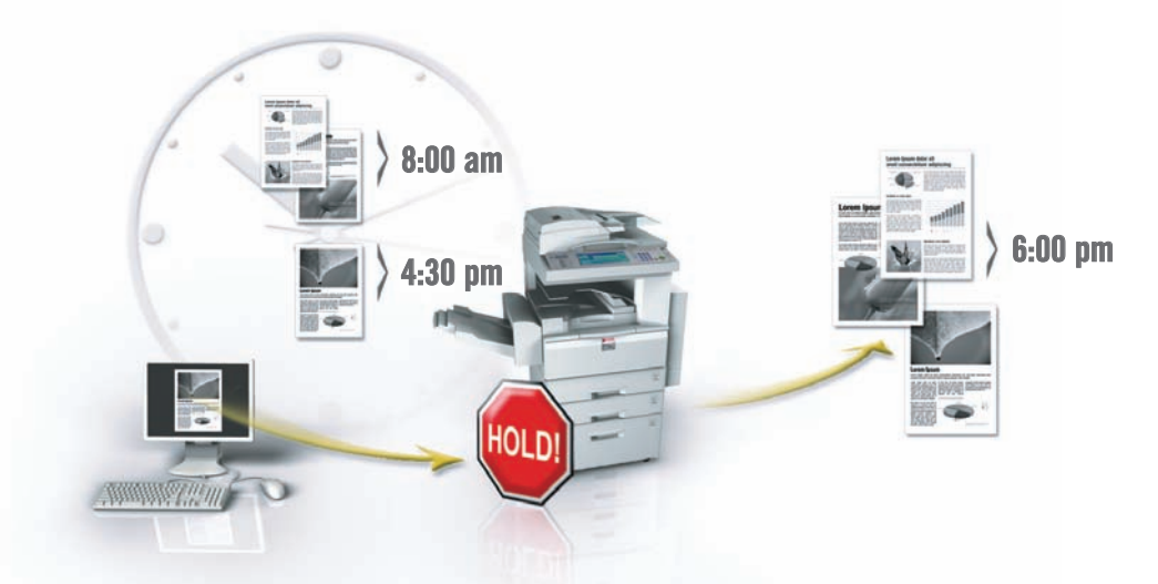
The Aficio™3025/3030 can hold print jobs you send during the day together with their settings. You simply release them on the device at a convenient time. As a 'virtual mailbox', this function prevents mixed-up output and keeps your prints confidential.

As office products have turned into advanced network devices, security threats have become a major concern. The Aficio™3025/3030 offer Windows® authentication which allows a user with access to the regular network, to also access the MFP. Other authentication methods have been developed to suit any network environment. To safeguard the data on the Hard Disk Drive, a Data Overwrite Security function is applicable. This unit ensures the hidden temporary data is overwritten with random data after completion of a job. Any security threat will be eliminated!