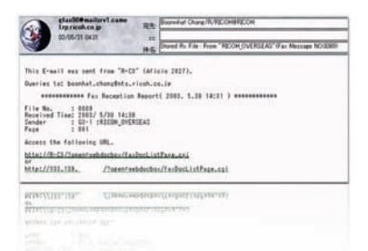
Prevent a huge e-mail inbox and enjoy the opportunity to download files at a later time: 'scan to URL' allows you, as receiver, to check the e-mail and decide whether and when to download the file.

How can you cut costs while improving your document handling? With developments in the field of communication and document management increasing day by day, you need a progressive solution. Combining the right hardware with the latest software, the Aficio™3025/3030 fit in seamlessly. Minimum investment, maximum return on it.