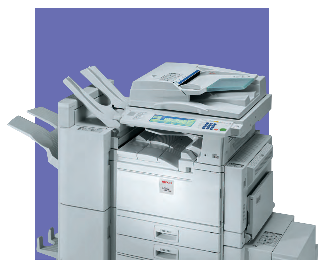
Aficio<sup>®</sup>MP 3500/MP 4500